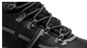
Non-metallic reinforced hooks.