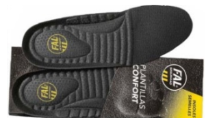
Removable Insole. Washable