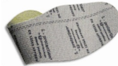
Flexible protective insole