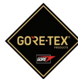
Waterproof + breathable lining membrane