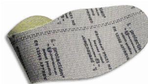
High tenacity polyester (HTP) Insole * Similar to Kevlar®