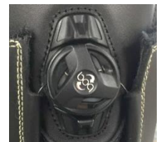
BOA® Closing system SHIELDED