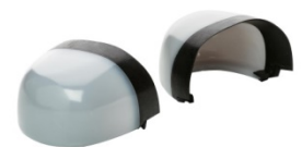
Vincap® composite Toe cap