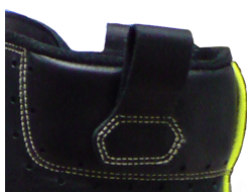
2 Wider pull straps Breathable Upper