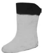
Waterproof Bootie Gore-Tex® Lining