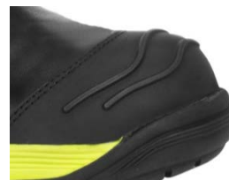
New improved rubber external protection